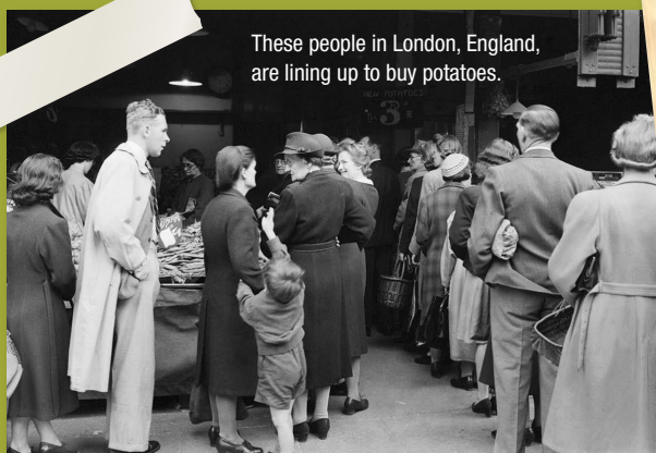
These people in London, England, are lining up to buy potatoes.