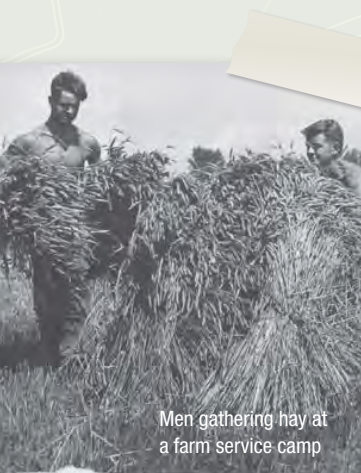
Men gathering hay at a farm service camp