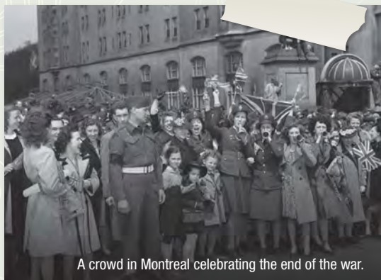
A crowd in Montreal celebrating the end of the war.