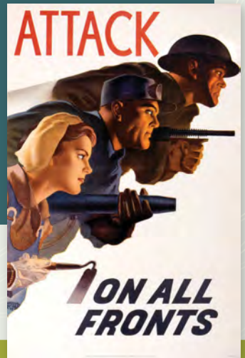
Library and Archives Canada, Canadian War Museum

Canadian war production moved fast — more than half of it happened in factories that didn’t exist in 1939. About one-third of it was for Canada’s use; the rest went to Great Britain, the United States and other Allied countries. Canada, a small nation of 11 million people, ranked fourth in the world in what it produced for the war effort. Canada also supplied raw materials like nickel, zinc and asbestos. The Allies would have struggled to win the war without the work of Canadian industry.